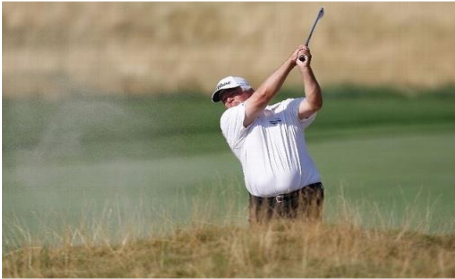
(Photo by Gregory Shamus/Getty Images, Scott Simpson hitting from the fairway in Lake Orion, MI)