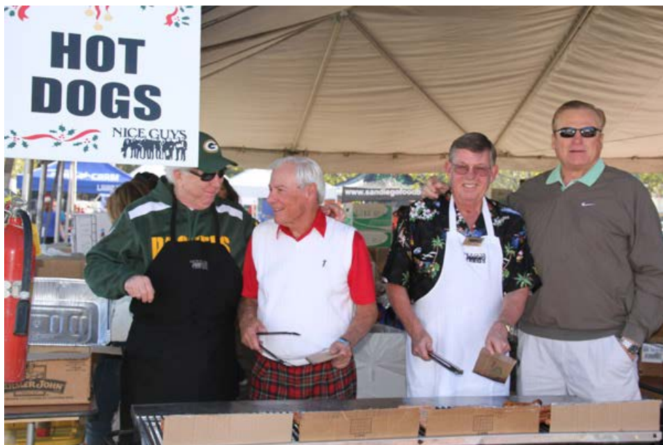
NICE GUYS OF SAN DIEGO CHRISTMAS PARTY

Just in Time for Foster Youth, is holding its annual My First Home for the Holidays campaign through Jan. 11. The goal of the campaign is to collect cash, gift cards, and in-kind donations of new household items such as pots and pans, small kitchen appliances, lamps, and bedding. Donations can be made online at www.jitfosteryouth.org .